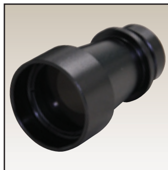
3 X long eye relief eyepiece