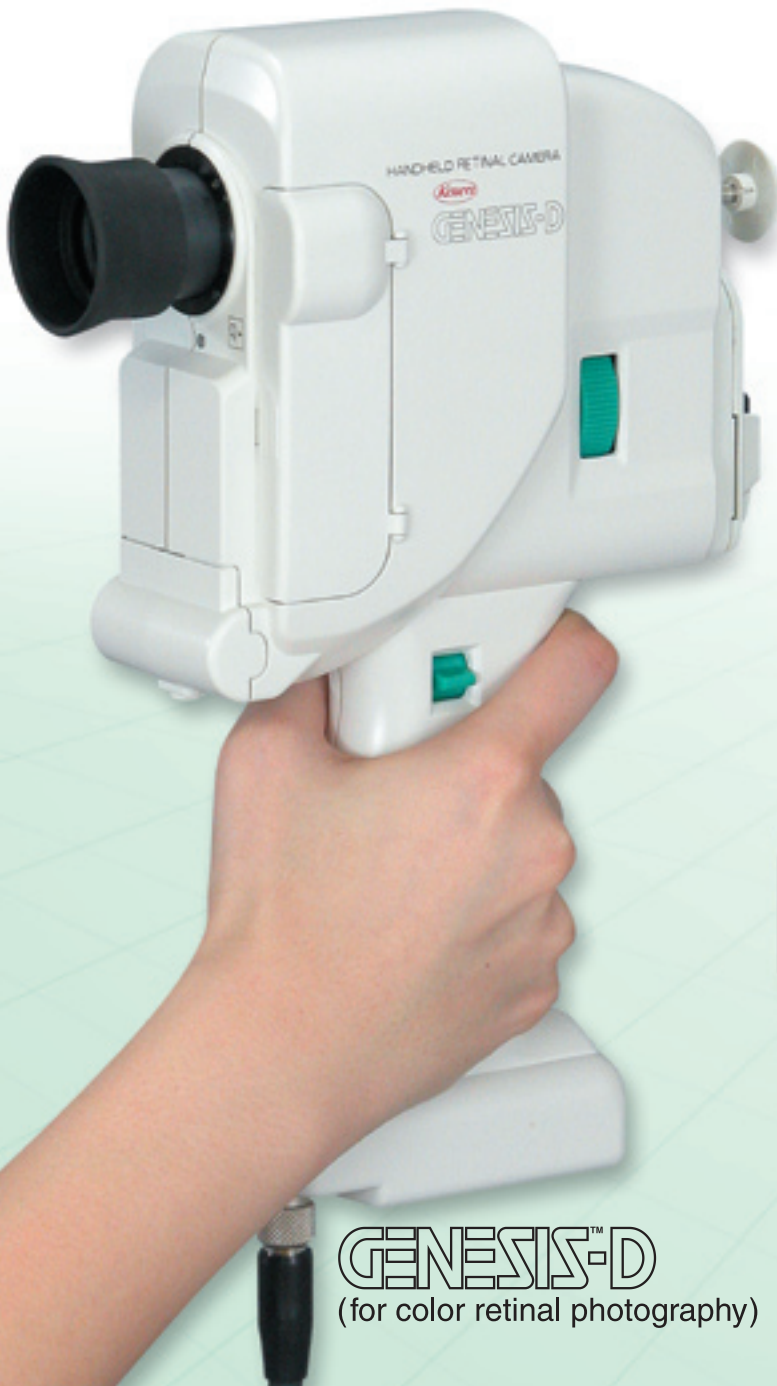
GENESIS-D TM (for color retinal photography)